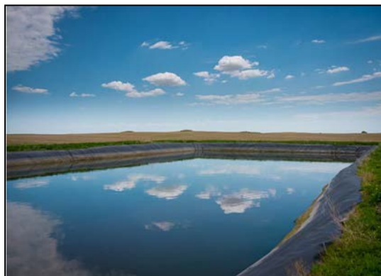
Treated Wastewater Ready for Reuse

In an area that suffers from major water supply and treatment issues, Target Hospitality quickly established a functional treatment system of a sort regional cities are now trying to build. 15 Such an effort, associated with workforce housing, represents a major contribution in sustainable development.