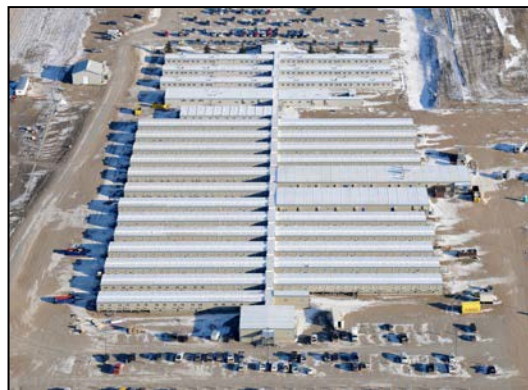
Tioga Lodge in Williams County, North Dakota, is the largest workforce housing facility in the United States

Successful businesses must be both “eco-efficient” (with the economic value-added being proportional to environmental impact) and “socio-efficient” (with the economic value-added being proportional to social impact). In other words, long-term business success requires attention to not only short- and long-term economic capital, but also long-term natural and social capital.