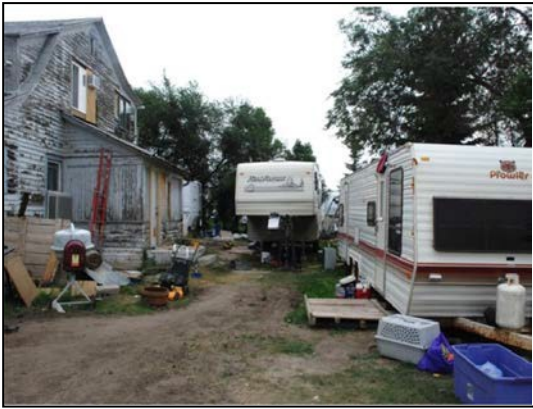
Makeshift Workforce Housing

Companies recognize they have a responsibility to be positive participants in the communities where they work. For remote industrial operations where workforce housing is required, the influx of workers and their impact on existing infrastructures is a focal point of community interaction and concern.