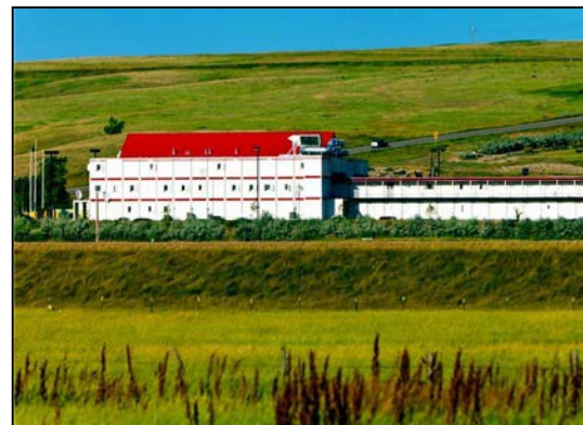
Muddy River Lodge Modular Workforce Housing

When the structures are no longer needed at one location, they can be moved to another. Operated by Target Hospitality, the Muddy River Lodge in North Dakota was moved there after serving as a housing facility for the 2010 Winter Olympics in Whistler, British Columbia. 11